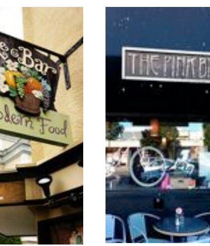
THE PINK BICYCLE

Great organic fair trade coffee, tea and vegan friendly light meals. Their soup is always vegan and delicious!!