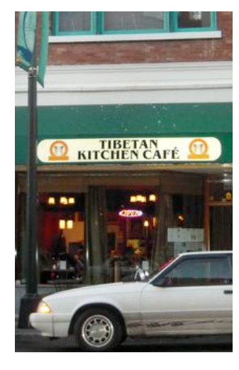
PEMBA'S TIBETAN KITCHEN 680 Broughton Street